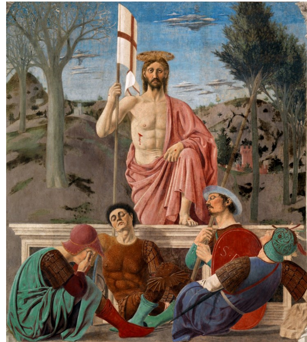
The Resurrection, Piero della Francesca, c. 1460s

I have risen, and I am with you still, alleluia.