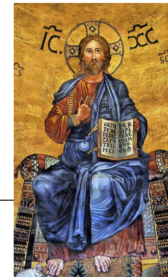
BE THOU MY VISION

Worship God, all you his angels. Sion has heard, and is glad, and the daughters of Judah rejoice.